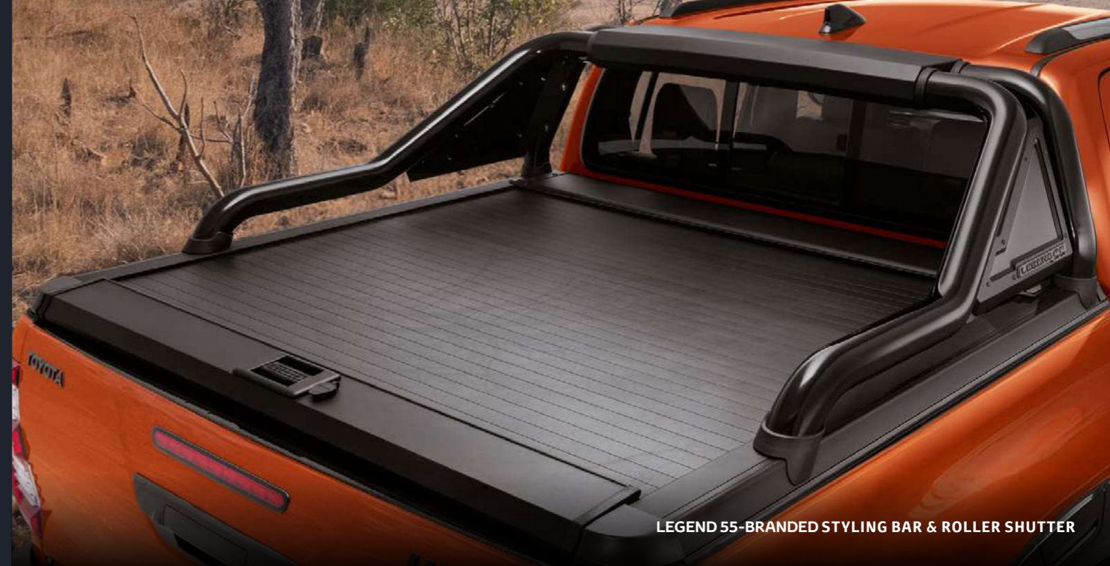
LEGEND 55-BRANDED STYLING BAR & ROLLER SHUTTER