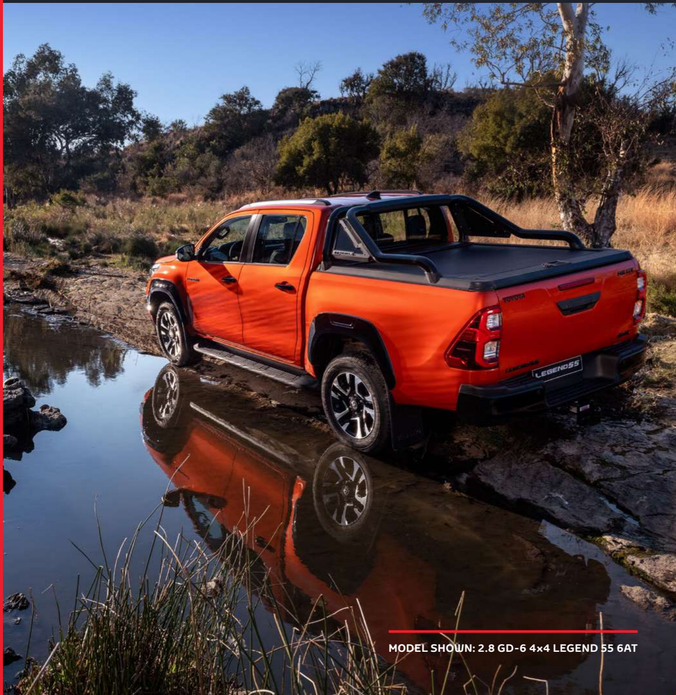
MODEL SHOWN: 2.8 GD-6 4x4 LEGEND 55 6AT

Trailer Sway Control (TSC)* keeps you and your trailer safe by minimising lateral movement from cross winds and road surface changes.