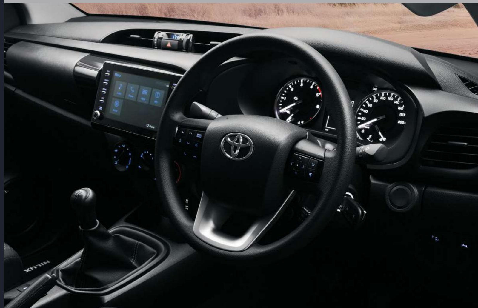
HILUX SR INTERIOR