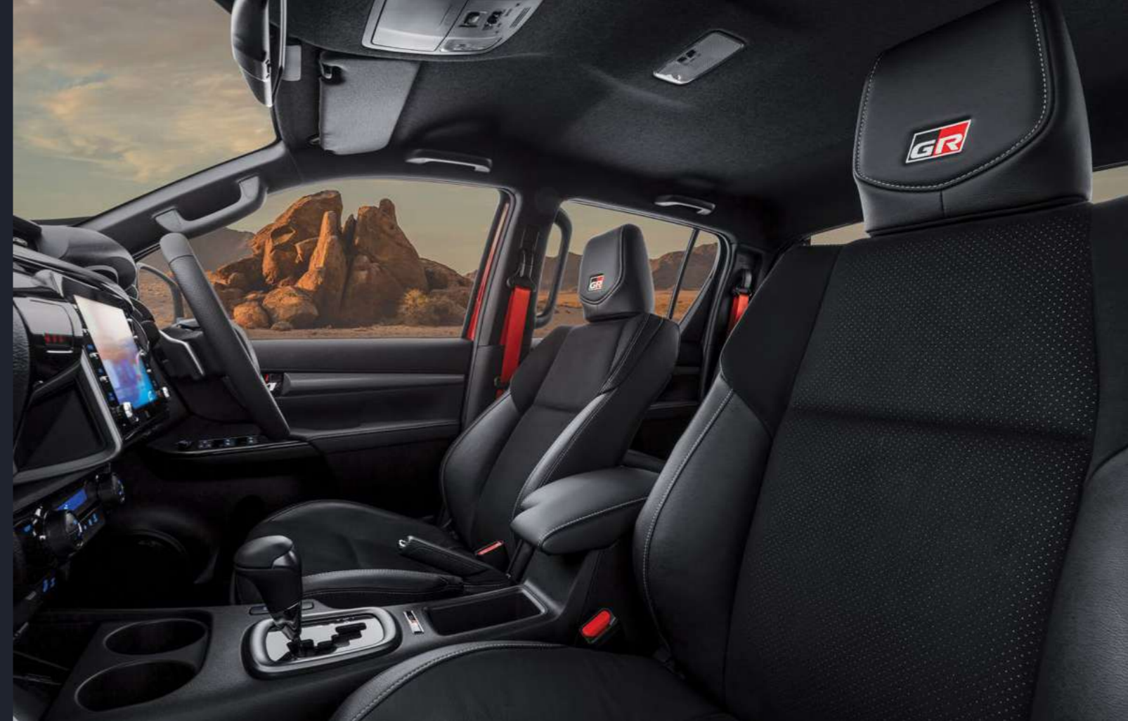
HILUX GR-SPORT INTERIOR