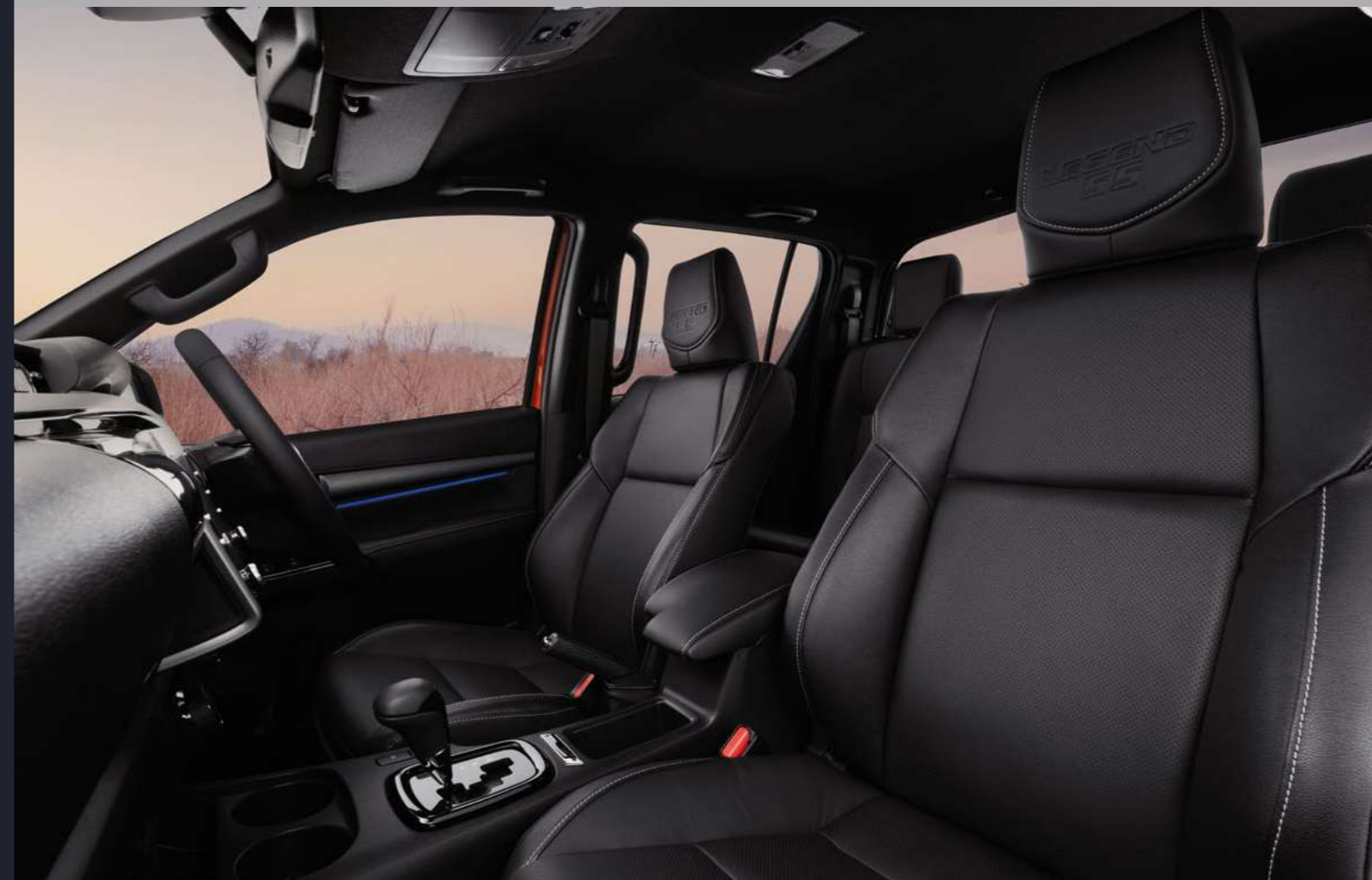
HILUX LEGEND 55 INTERIOR