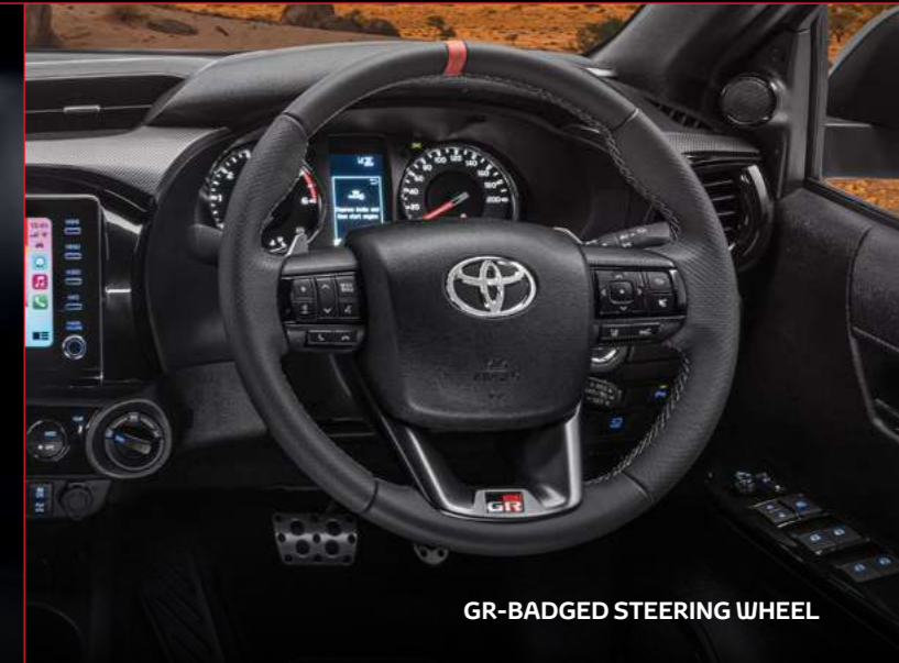
GR-BADGED STEERING WHEEL