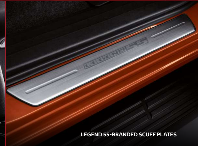
LEGEND 55-BRANDED SCUFF PLATES