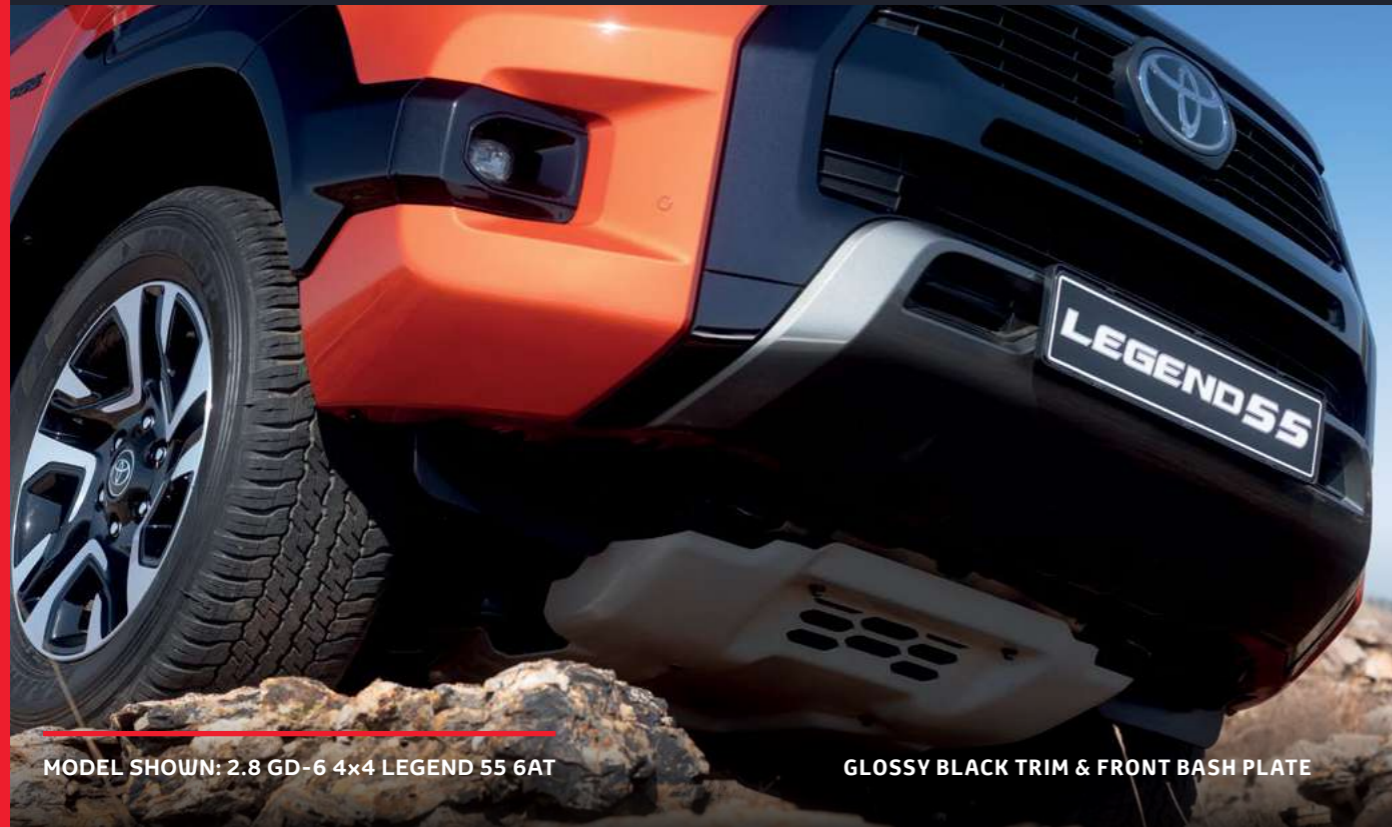
MODEL SHOWN: 2.8 GD-6 4x4 LEGEND 55 6AT