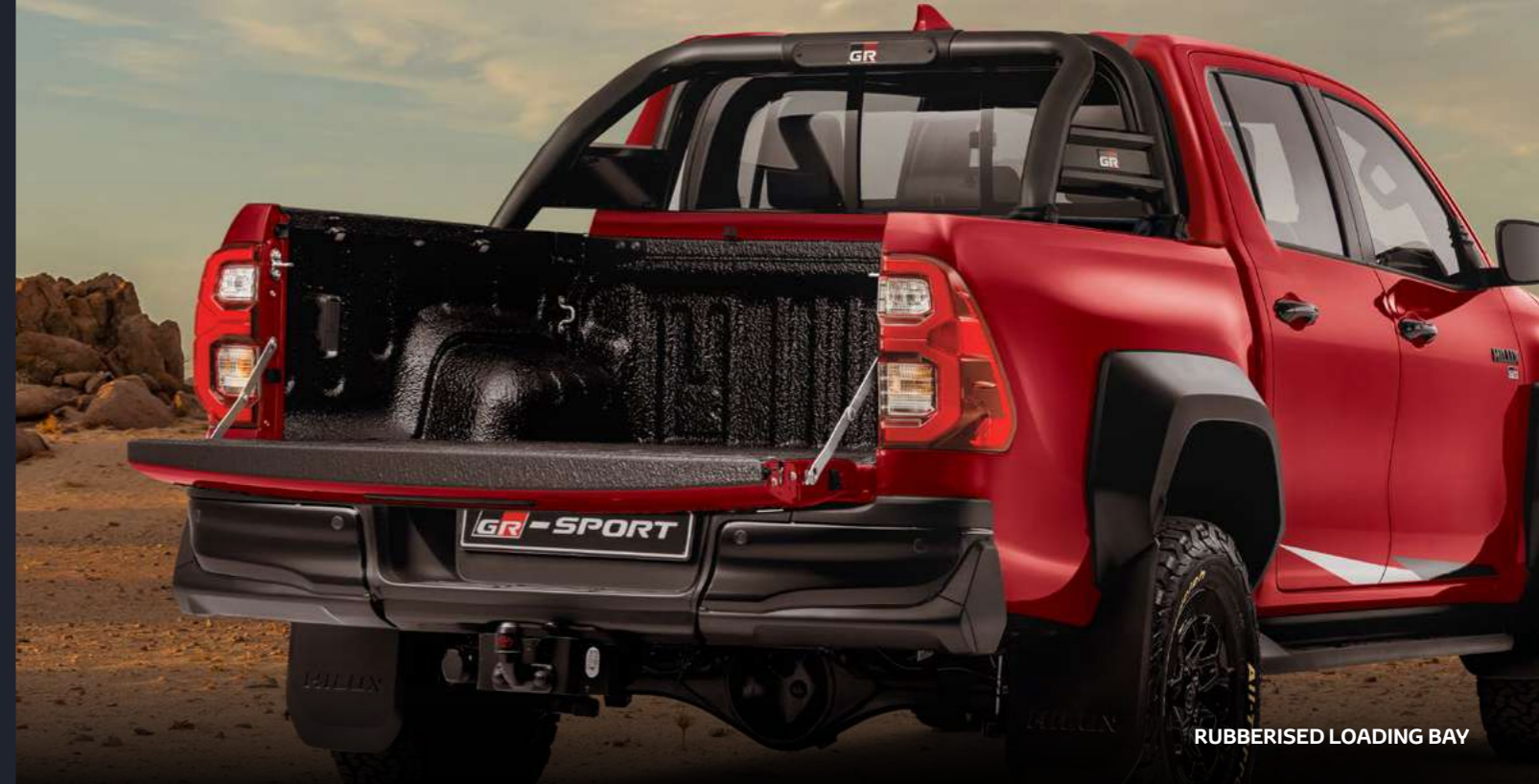
RUBBERISED LOADING BAY

Accentuating its broad stance, the GR-Sport comes standard with Wide Tread overfenders and gloss-black, optimally weighted 17" alloys, shod with rugged 265/65 R17 BF Goodrich All-Terrain Tyres. Spotlighting the rear, there's a fully rubberised loading bay as well as a rugged GR-Sport rollbar and a complementary tonneau cover.