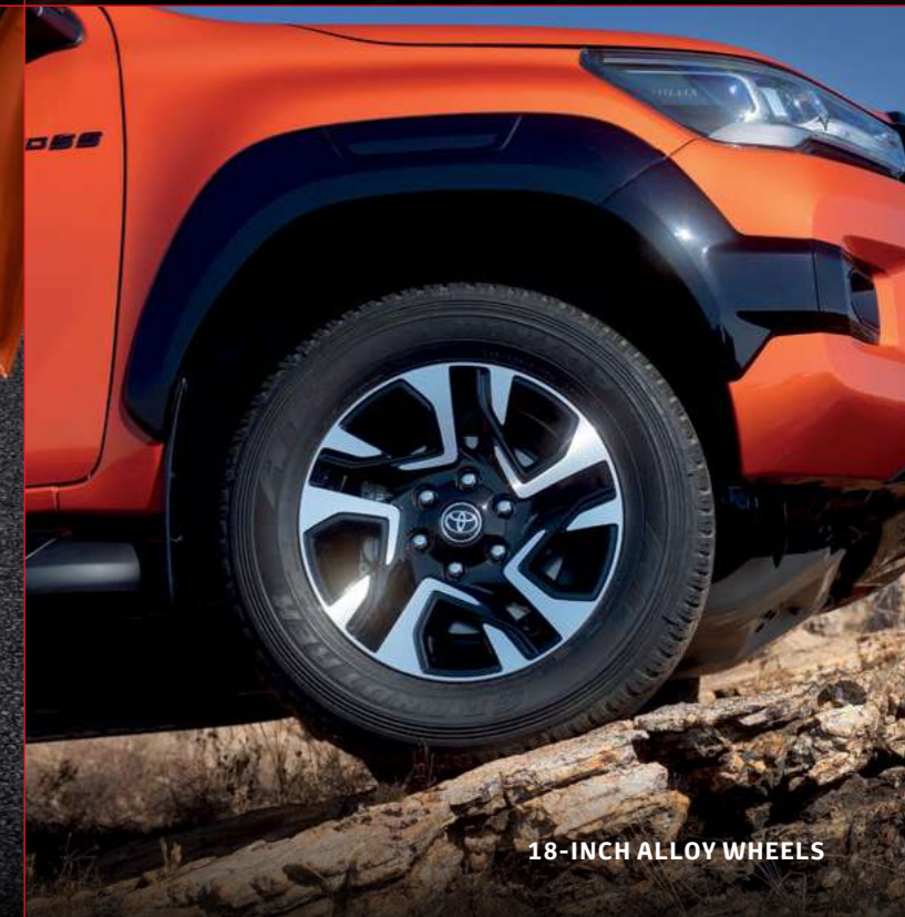
18-INCH ALLOY WHEELS