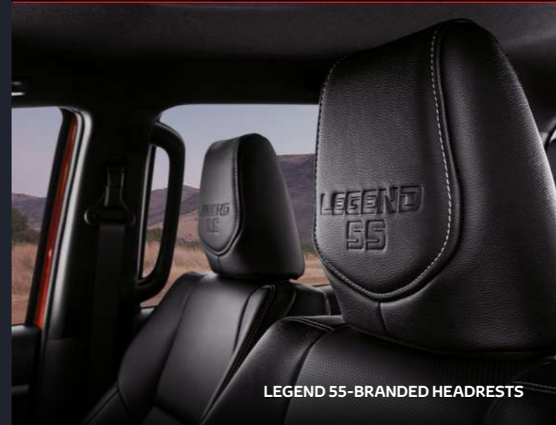
LEGEND 55-BRANDED HEADRESTS