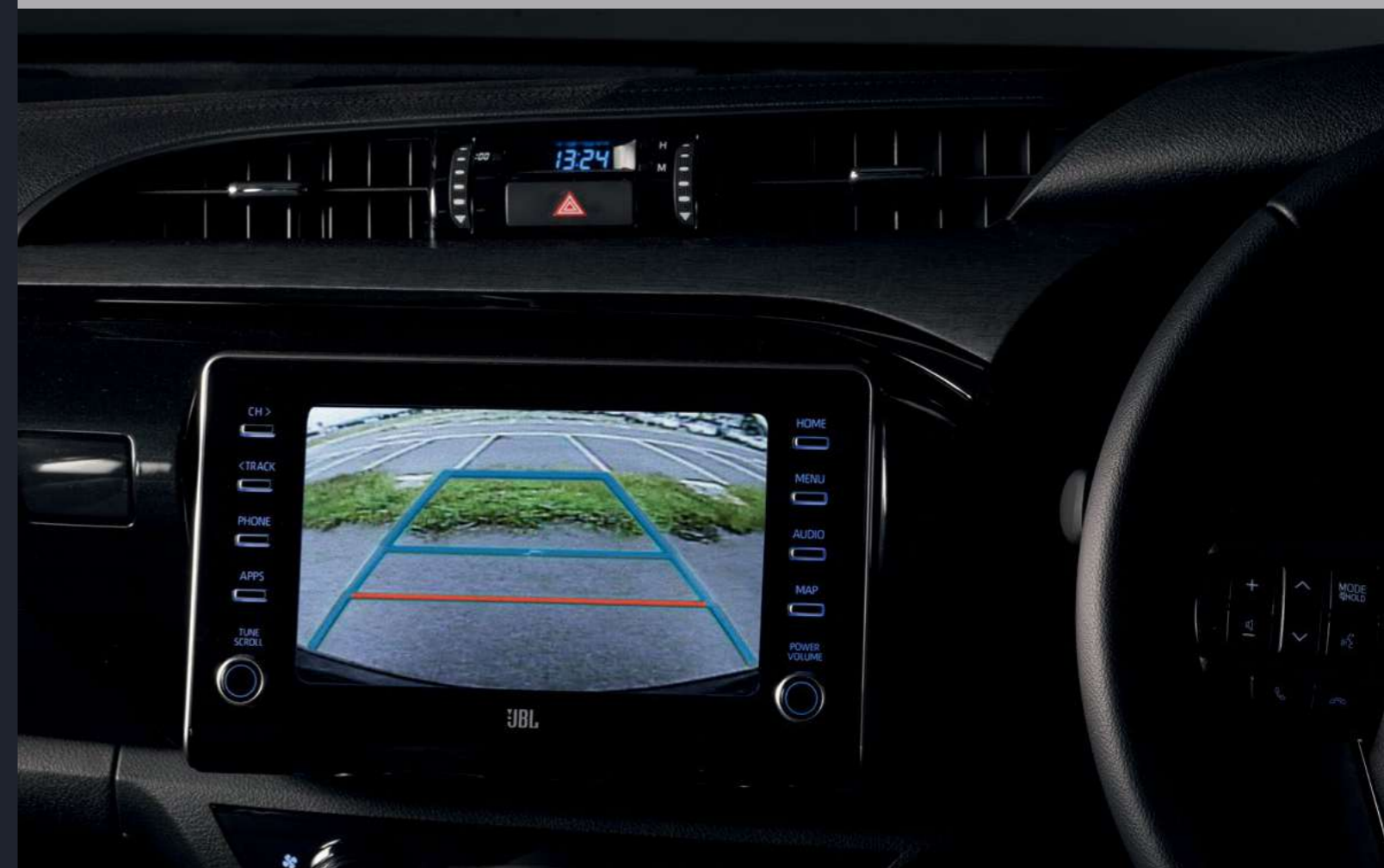
REVERSE CAMERA DISPLAY*