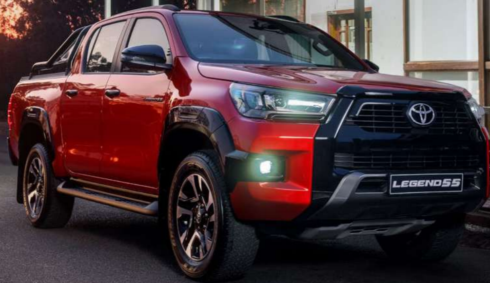
MODEL SHOWN: 2.8 GD-6 4x4 LEGEND 55 6AT

LEGENDARY TOUGHNESS REQUIRES LEGENDARY POWER. HELPING YOU WELCOME ANY CHALLENGE IS A RANGE OF PETROL, TURBODIESEL AND 48V ENGINES, FITTED WITH EITHER 5-SPEED OR 6-SPEED MANUAL OR 6-SPEED AUTOMATIC TRANSMISSIONS.