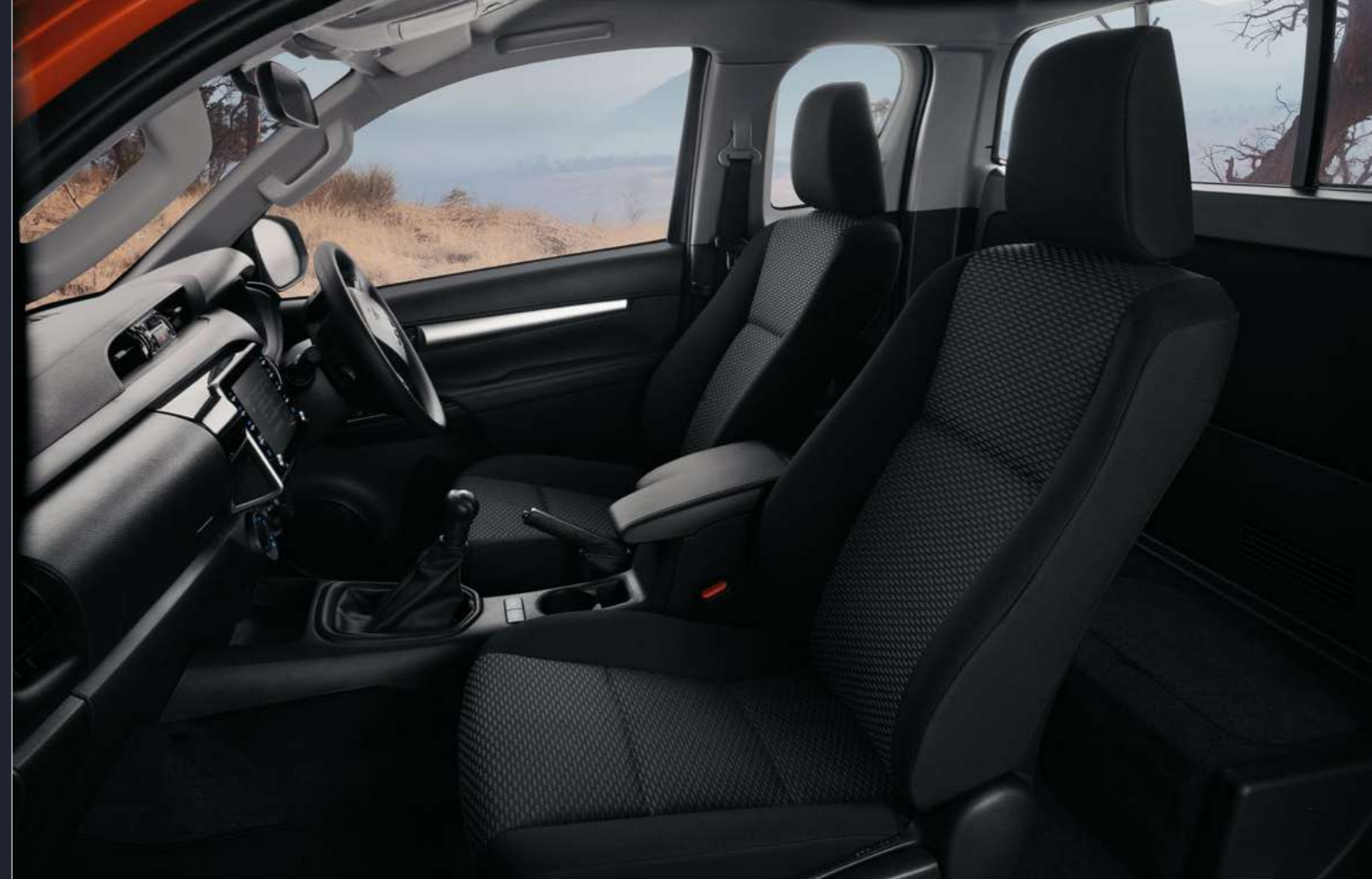
HILUX RAIDER INTERIOR