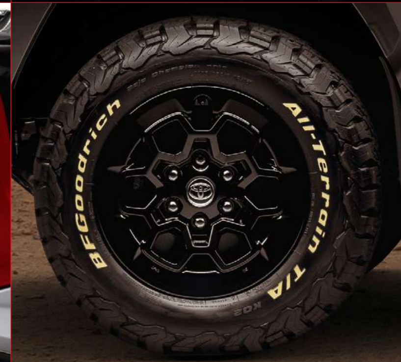
17" ALLOY-BF GOODRICH ALL-TERRAIN TYRES