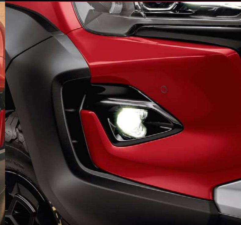
LED FOG LAMPS